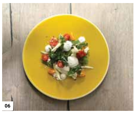
04. The Motto 05. Karmeliter Markt 06. Labstelle